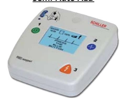
DF/531 – Semi-Automatic Pocket Sized AED

DF/532 – Semi-Automatic Pocket Sized AED with Manual Override