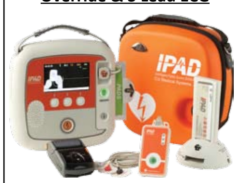
DF/422 – Complete with Carry Case, Rechargeable Battery & Dock, Pads & Bluetooth 3 Lead ECG Module

DF/423 – Value Pack – As above with Bluetooth Printer