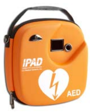
DF/401 – Complete with 2 sets of pads, 2 AED starter kits, a 4 year lithium battery and a carry case