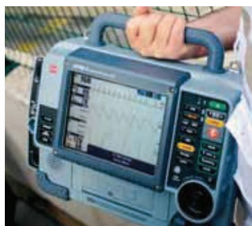
Dual-mode LCD screen with SunVue display