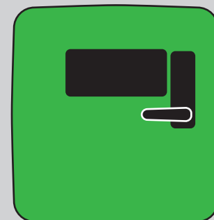
Defib Store 4000 Ile