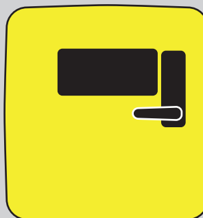
Defib Store 4000 Ile

Battery powered, motion sensor LED light to illuminate cabinet on opening. Easily detachable for use as a torch in a rescue